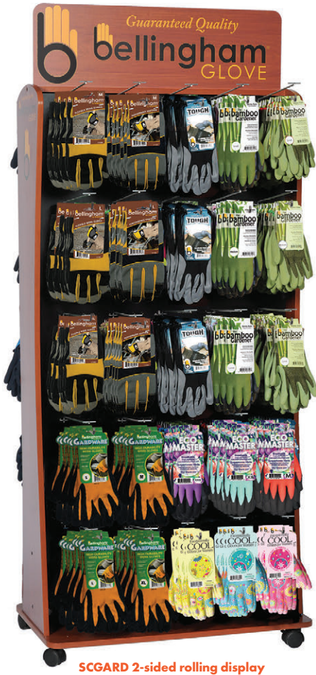
SCGARD 2-sided rolling display